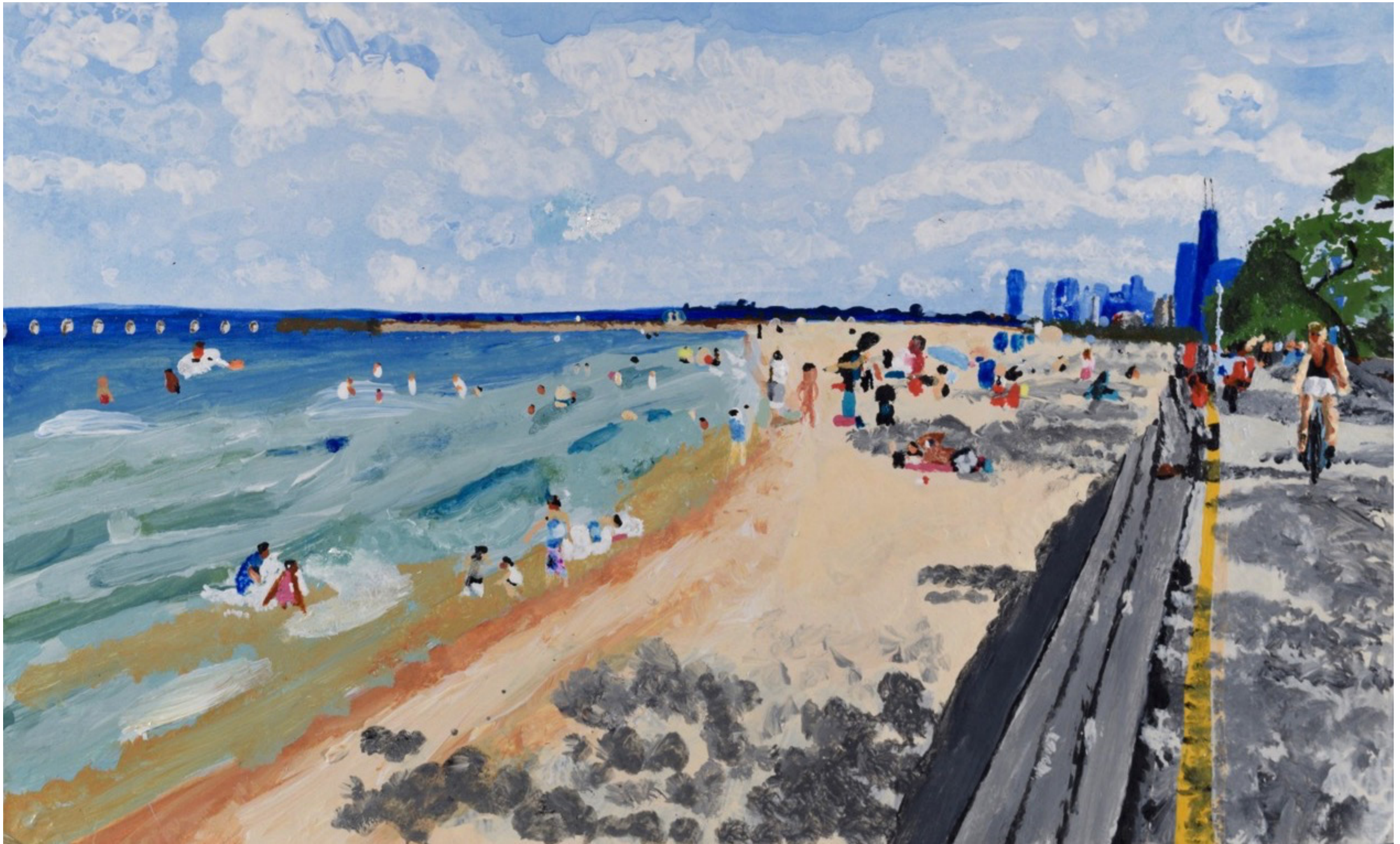
Guy Conners North Avenue Beach, 2017 Watercolor on paper